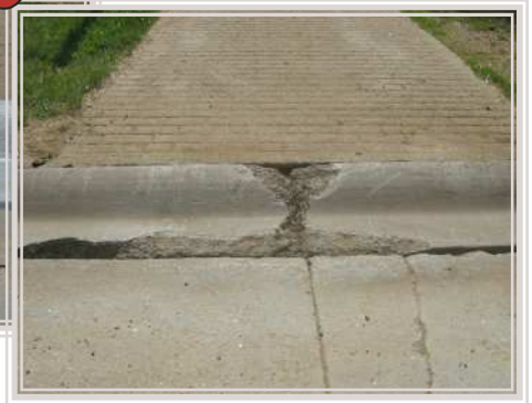
Kerb before repair

Restore with rapid setting repair mixture