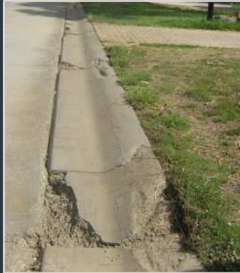
Kerb before repair