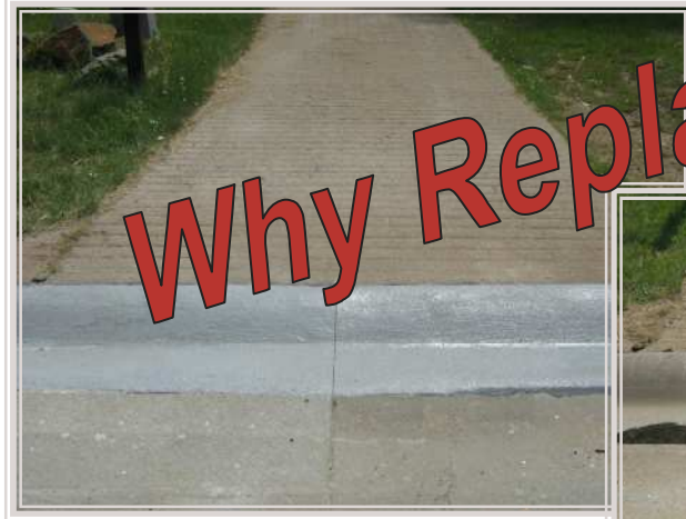
Kerb after repair