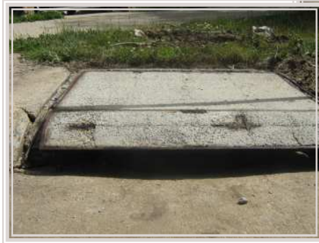
Pit before repair

Restore with rapid setting repair mixture