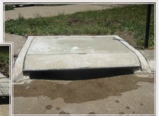
Pit after repair

Super-Quik™ has become a popular choice in preference to expensive replacement practices or chemical based alternatives.