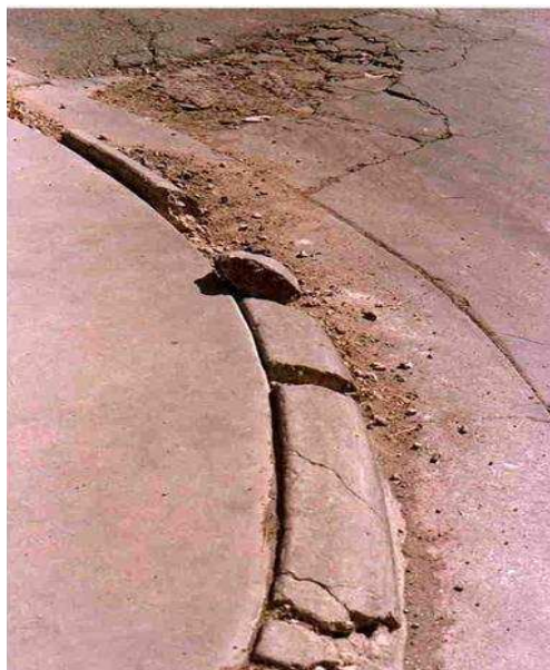
Damaged kerb and road - Before