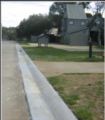
Kerb after repair