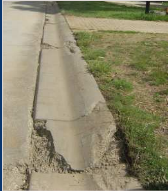
Kerb before repair