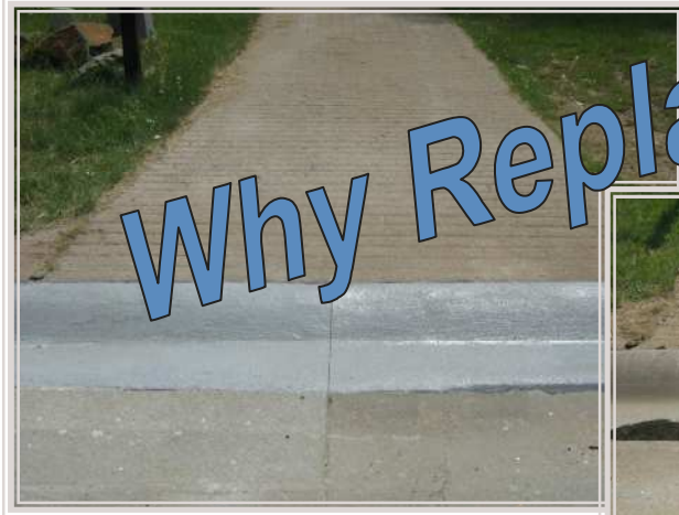
Kerb after repair